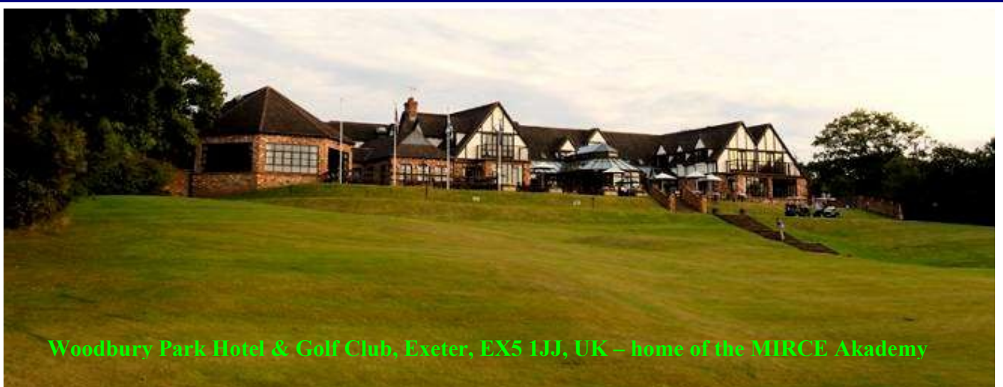
Woodbury Park Hotel & Golf Club, Exeter, EX5 1JJ, UK – home of the MIRCE Akademy