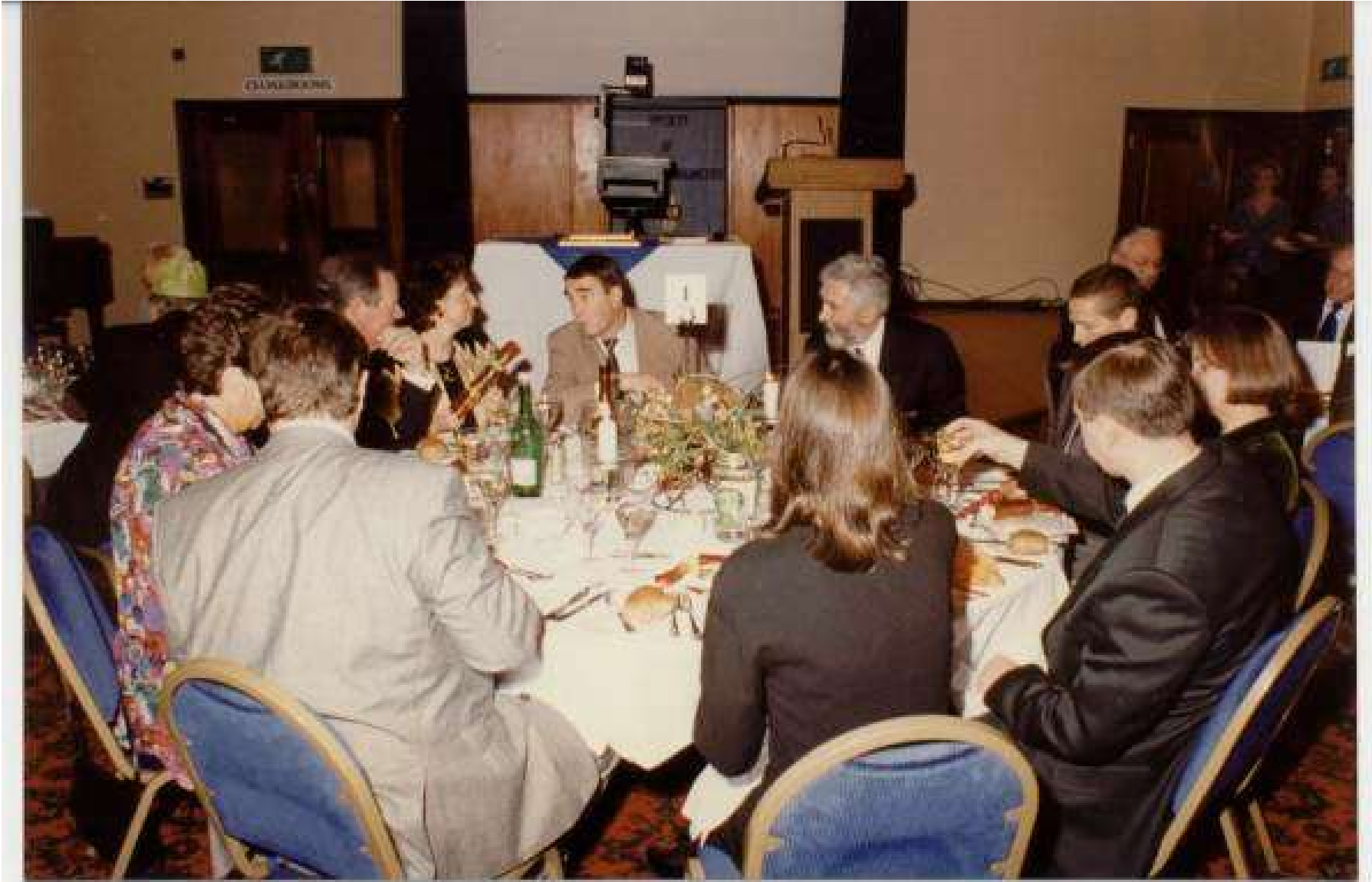
Albanian – Gezuar Vitin e Ri