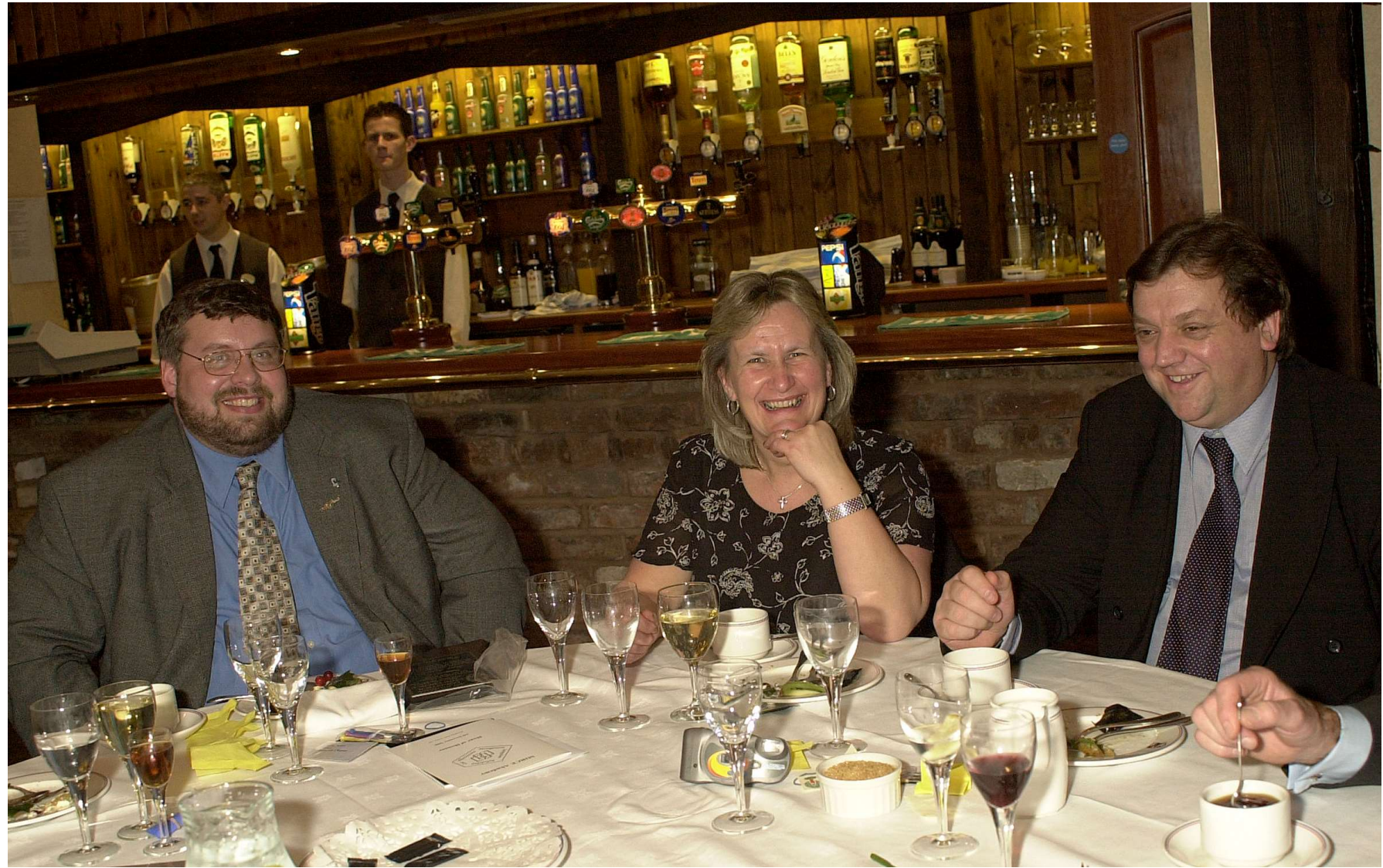
Catalan- Felic any nou