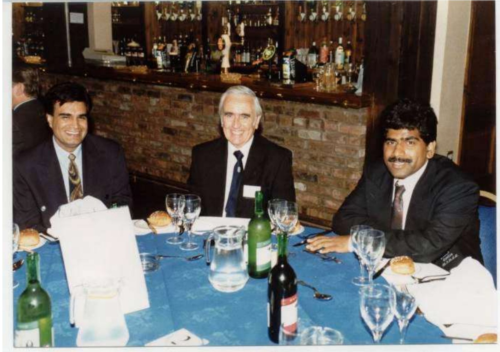
French- Bonne Année