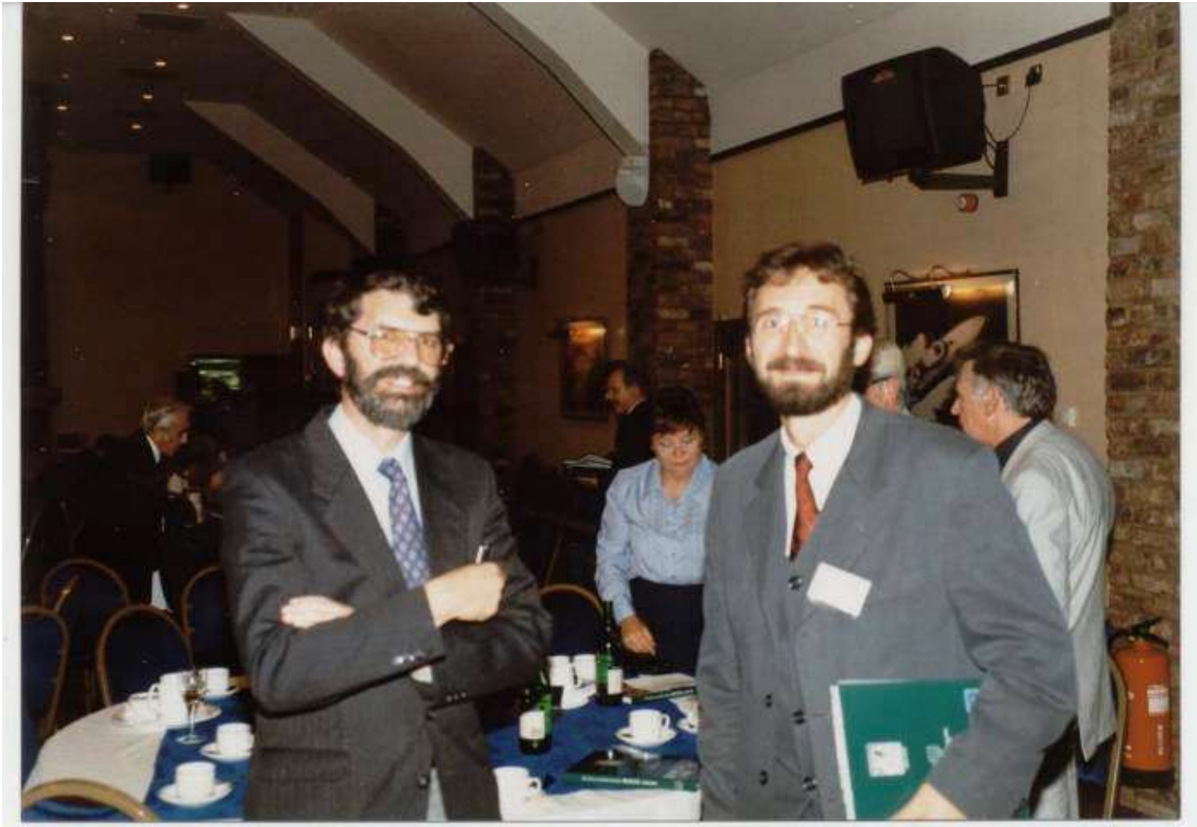
Maltese- Is Sena it -Tajba