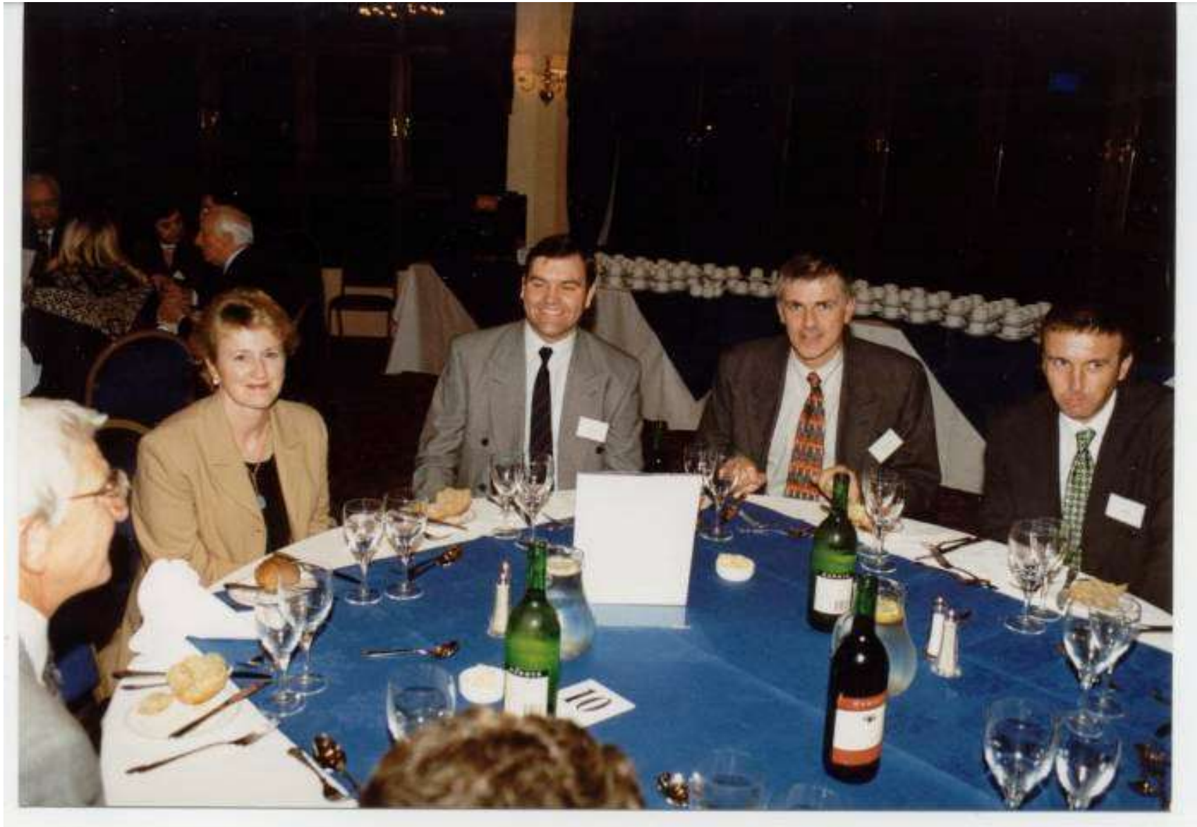
German- Gutes Neues Jahr