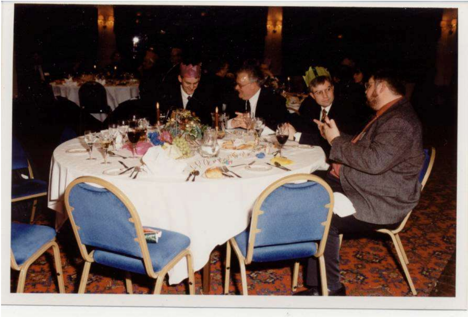
Spanish- Feliz Año Nuevo