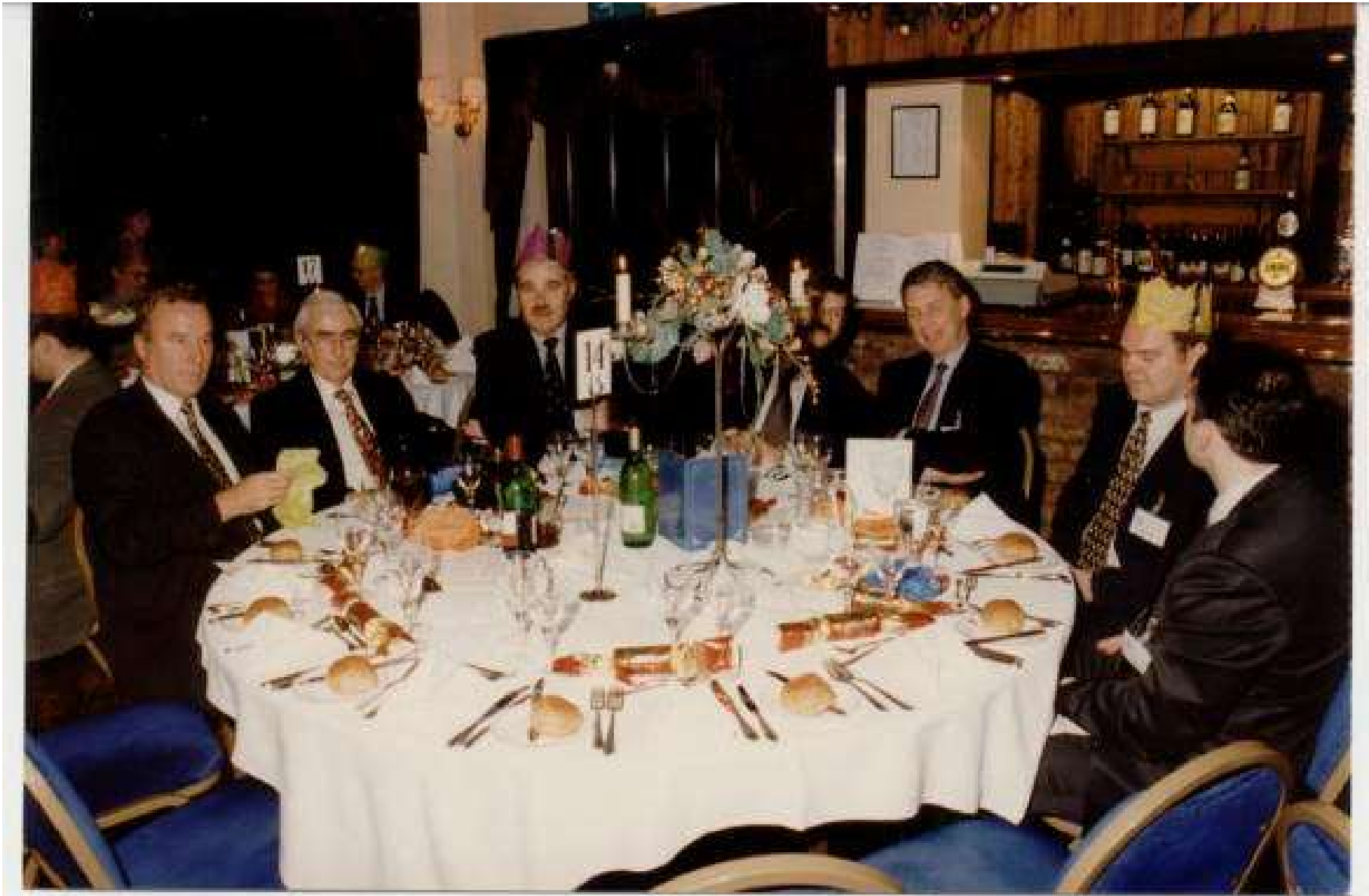
Turkish- Mutlu yillar