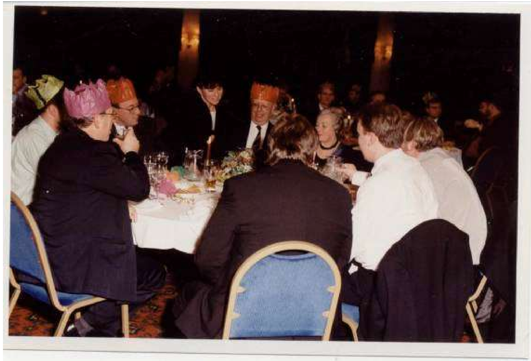
Bulgarian– sh-tast-liva No-va go-din-a