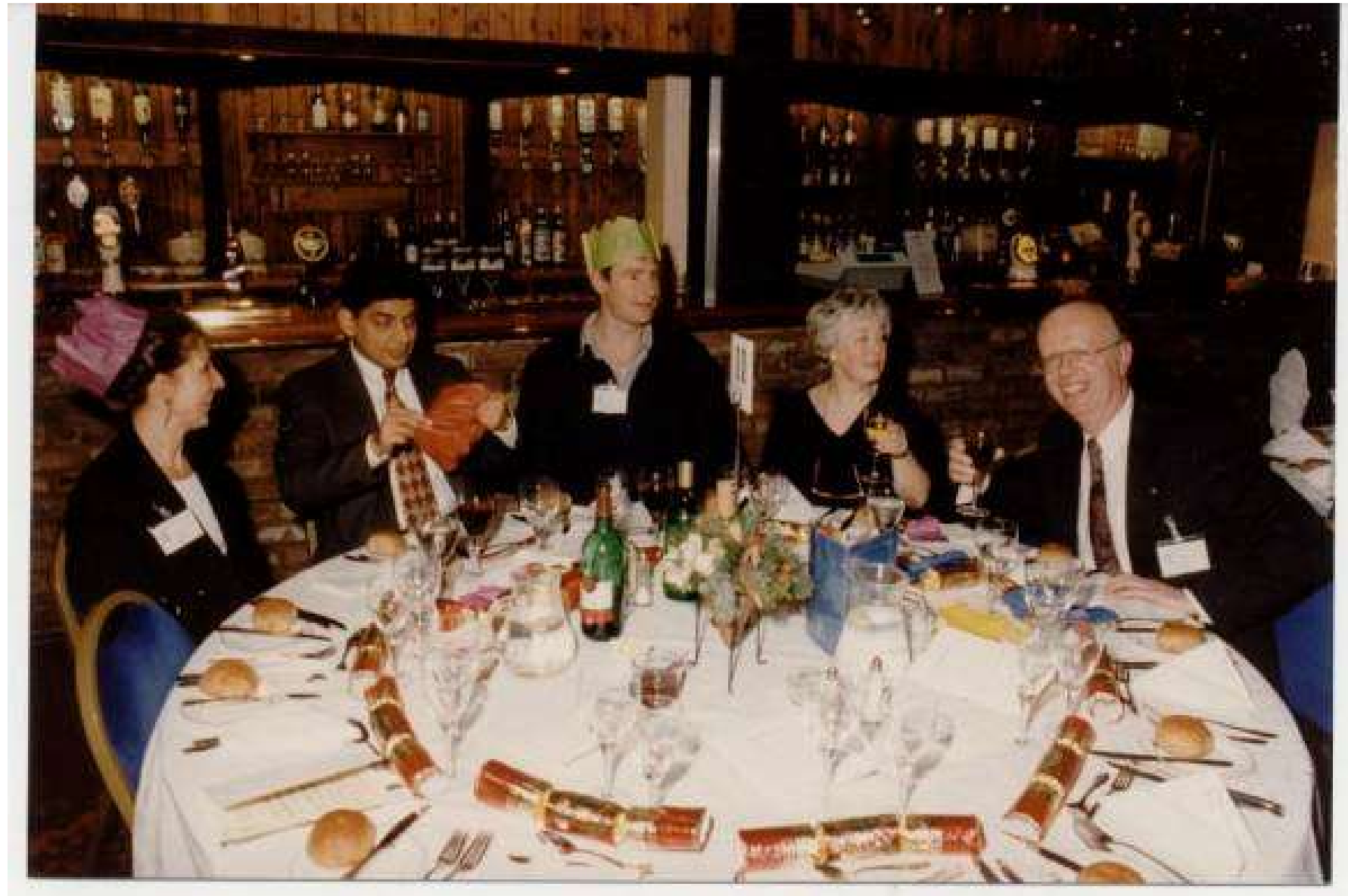
Dutch- Gelukkig Nieuwjaar