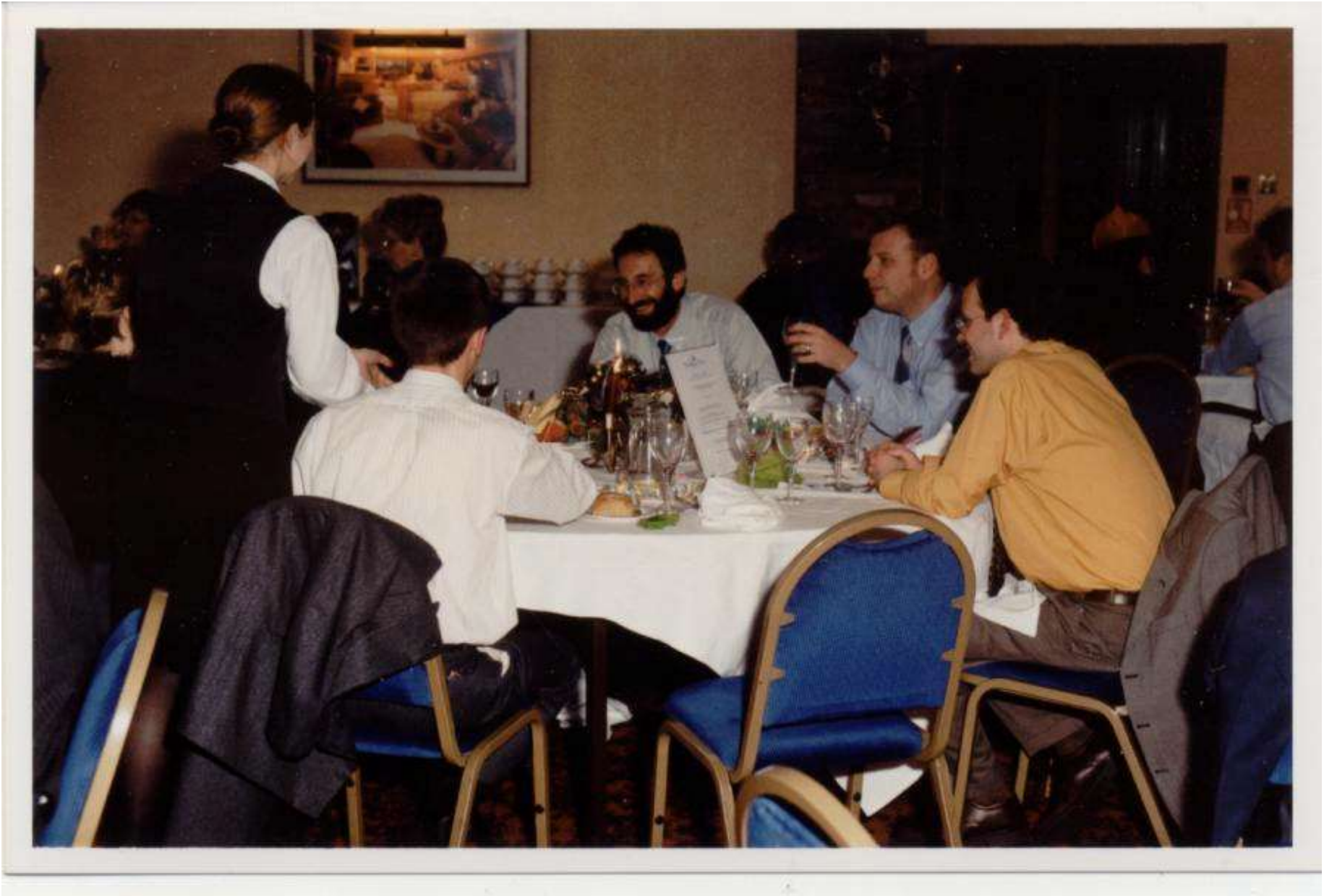
Portuguese- Feliz Ano Novo