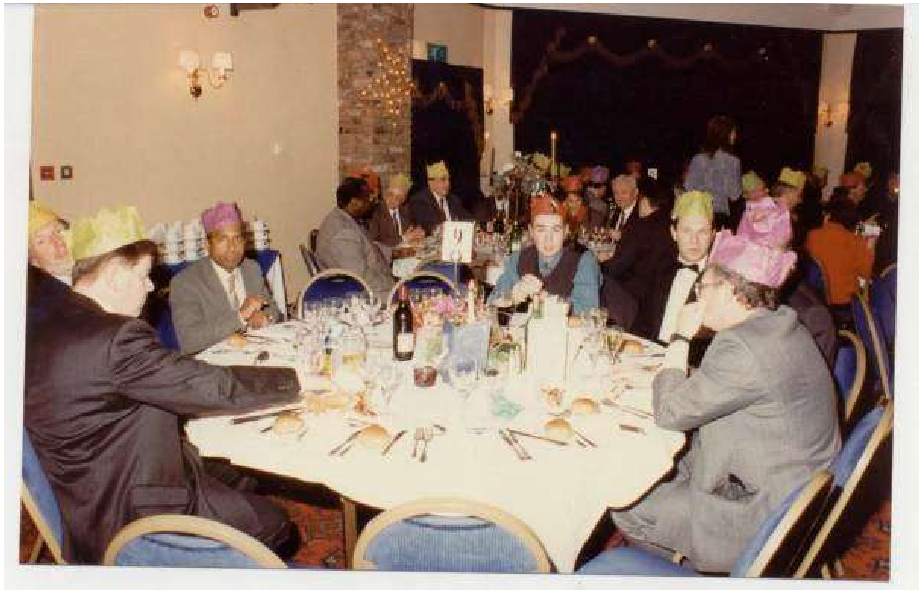
Romanian- La Mul?i Ani