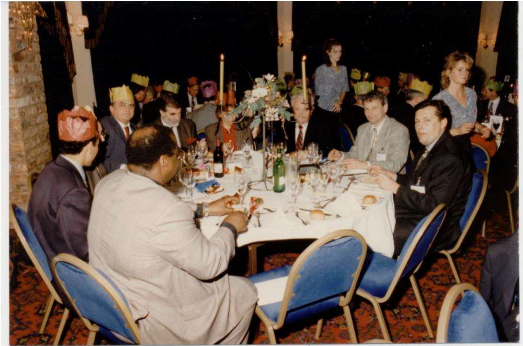
Welsh- blwyddyn newydd dda