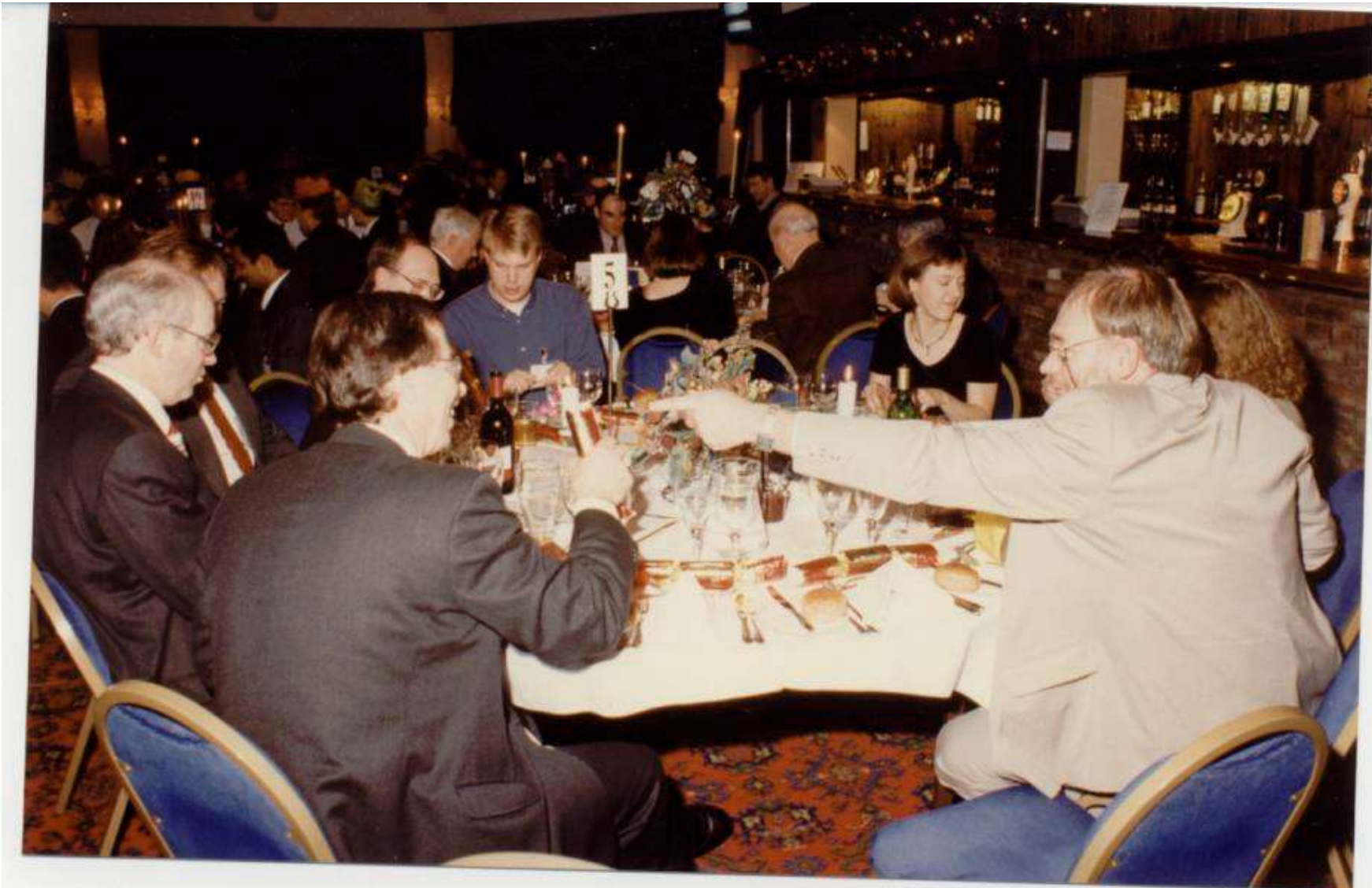
Russian- s novim godom