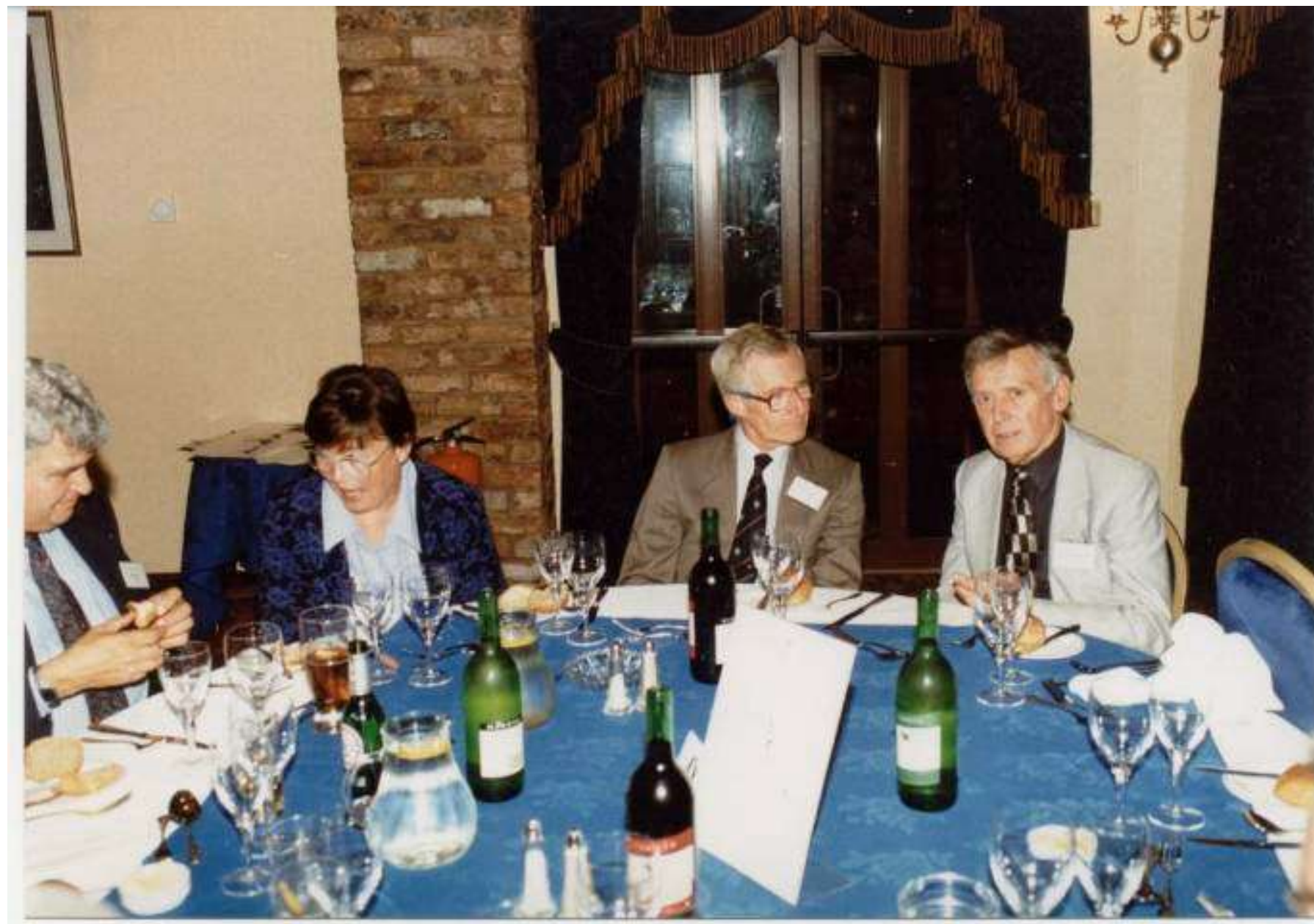
Irish- Bhliain nua sásta