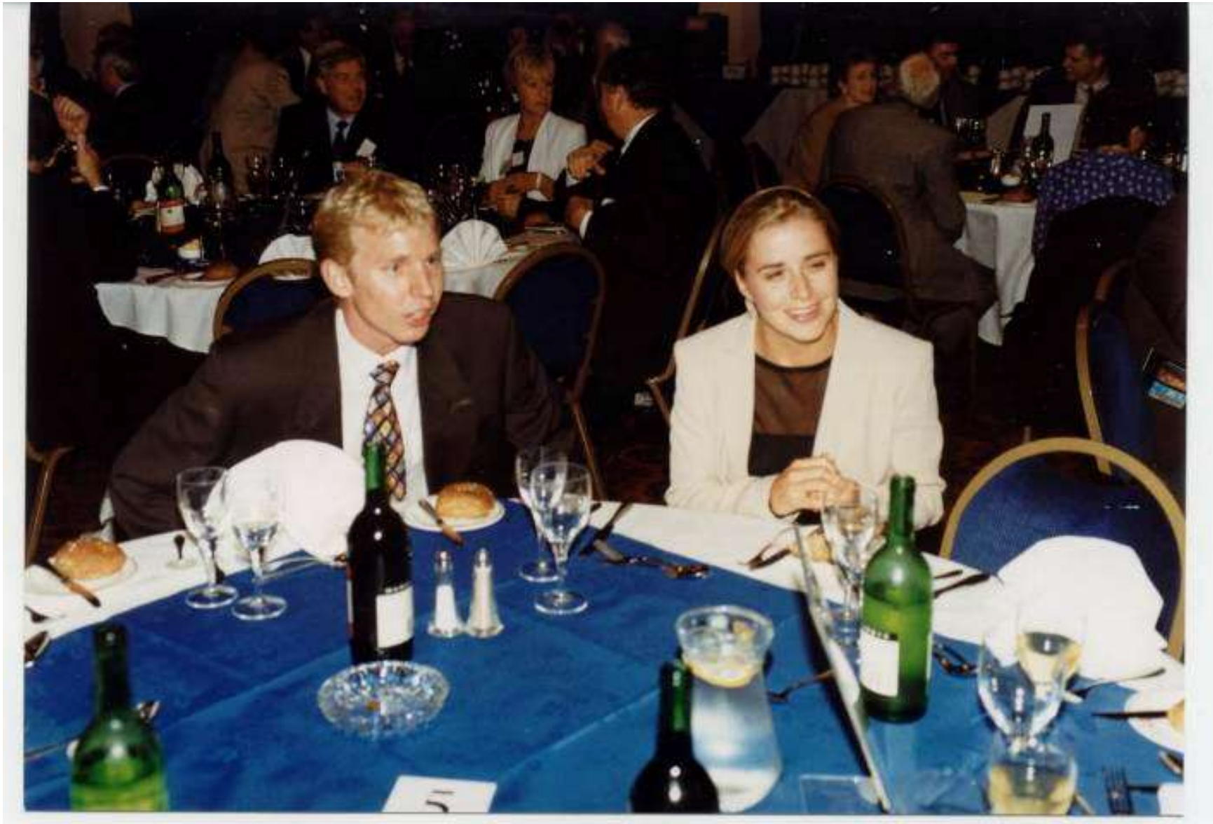
Filipino- Manigong Bagong Taon