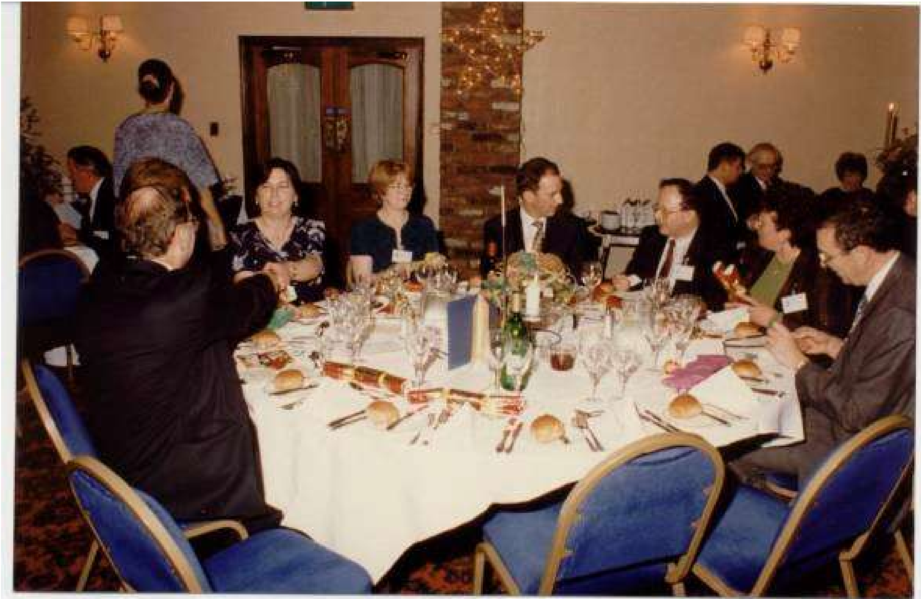
Bosnian- sretna nova godina