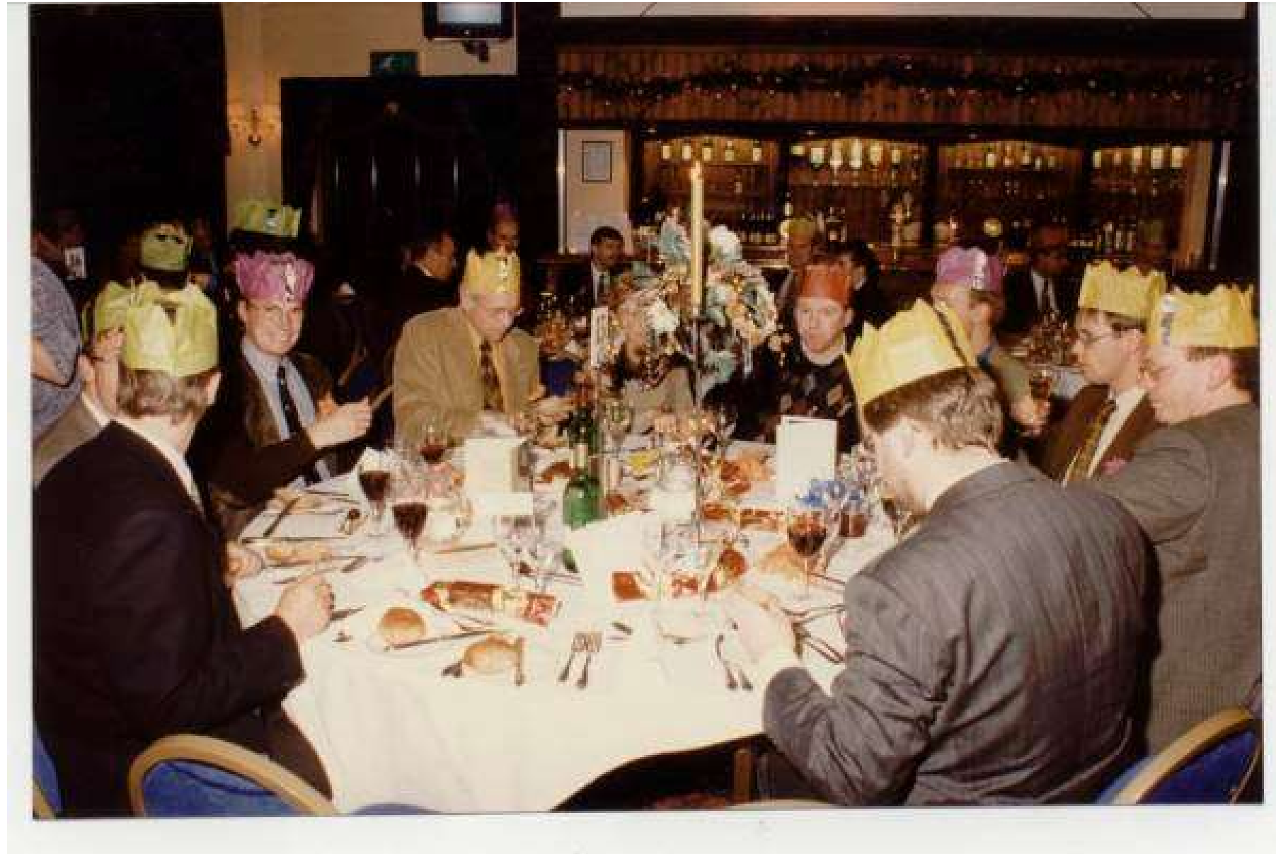
Greek- kali chronya