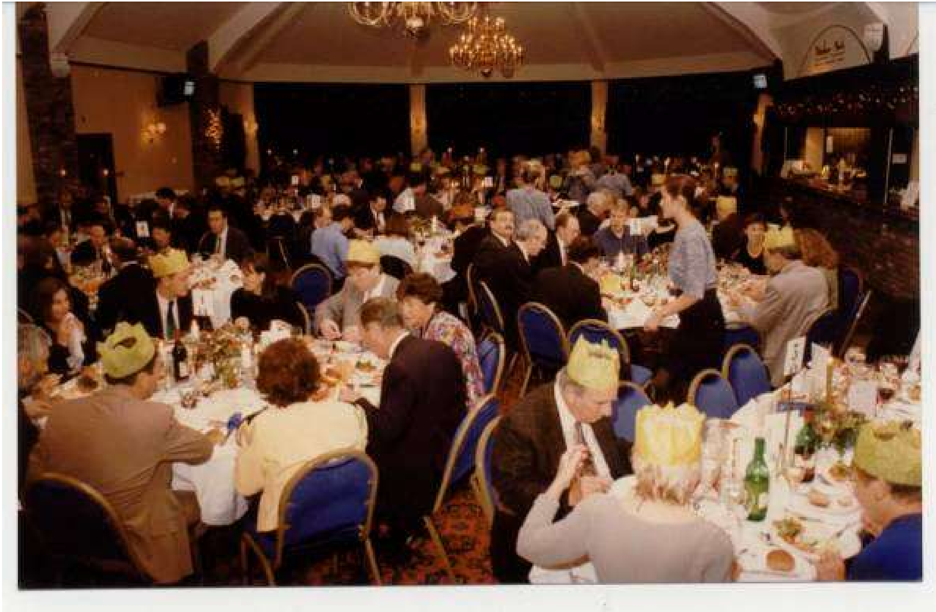
Hebrew- shana tova