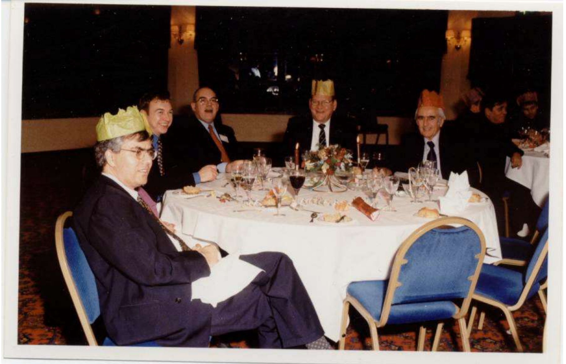
Urdu- nayya saal mubarak